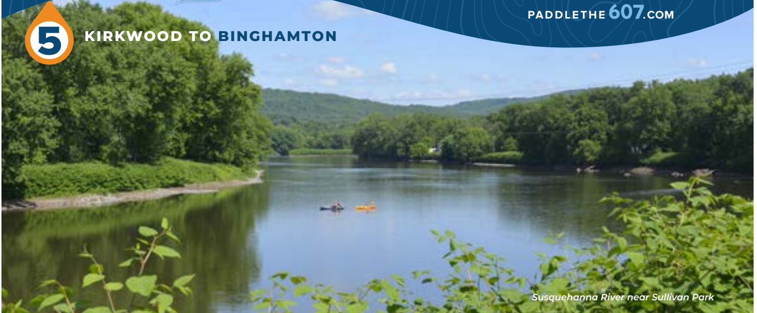
Susquehanna River near Sullivan Park