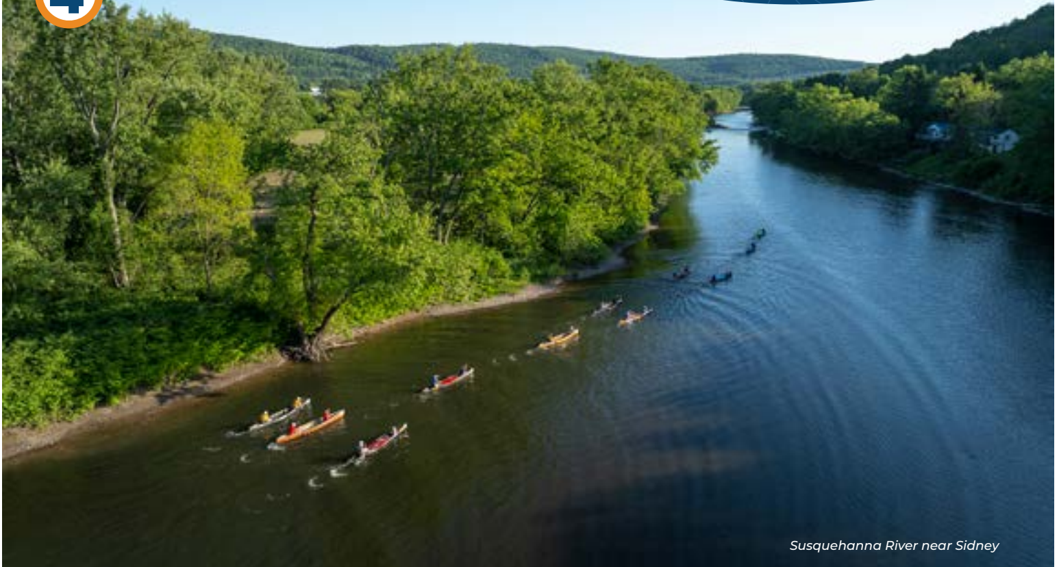
Susquehanna River near Sidney