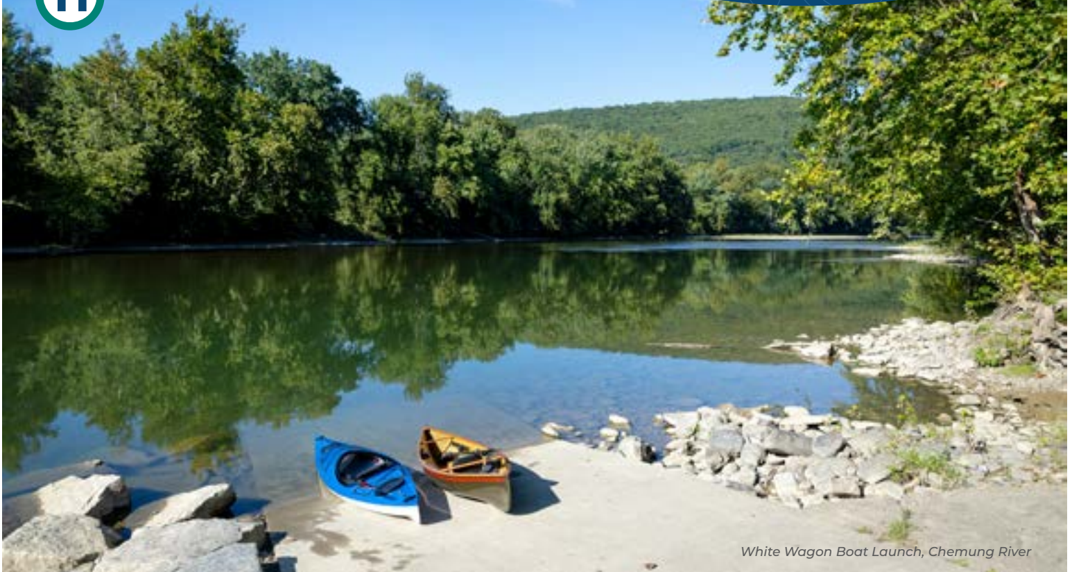
White Wagon Boat Launch, Chemung River